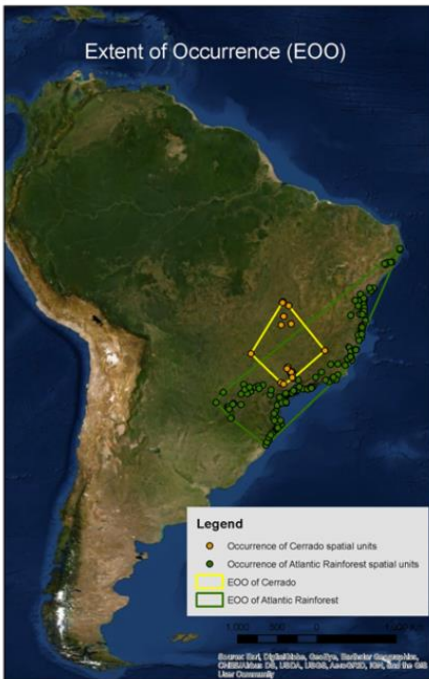
Figure S2. The indigenous range of Euterpe edulis .