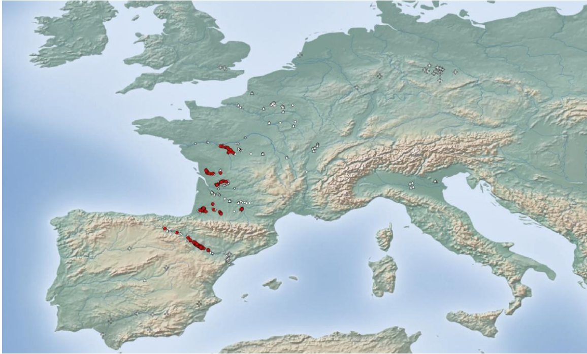
Figure S2. Ancient and current distribution of Pseudunio auricularius , from Nakamura et al. (2024). Red dots indicate live specimens; white dots indicate shells only; white triangles represent historical data (literature, museum collections); white crosses indicate fossil specimens.