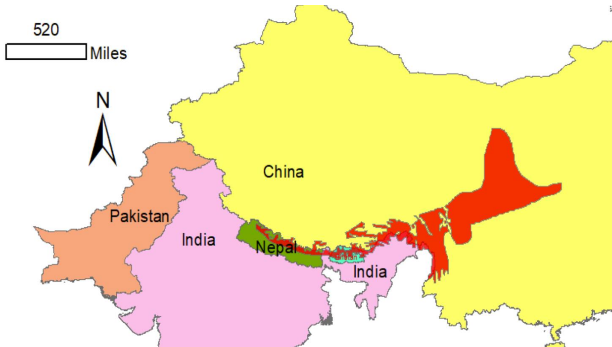
Figure S3. Current range of the Blood Pheasant. The red area shows the current range, as per BirdLife International (2024).