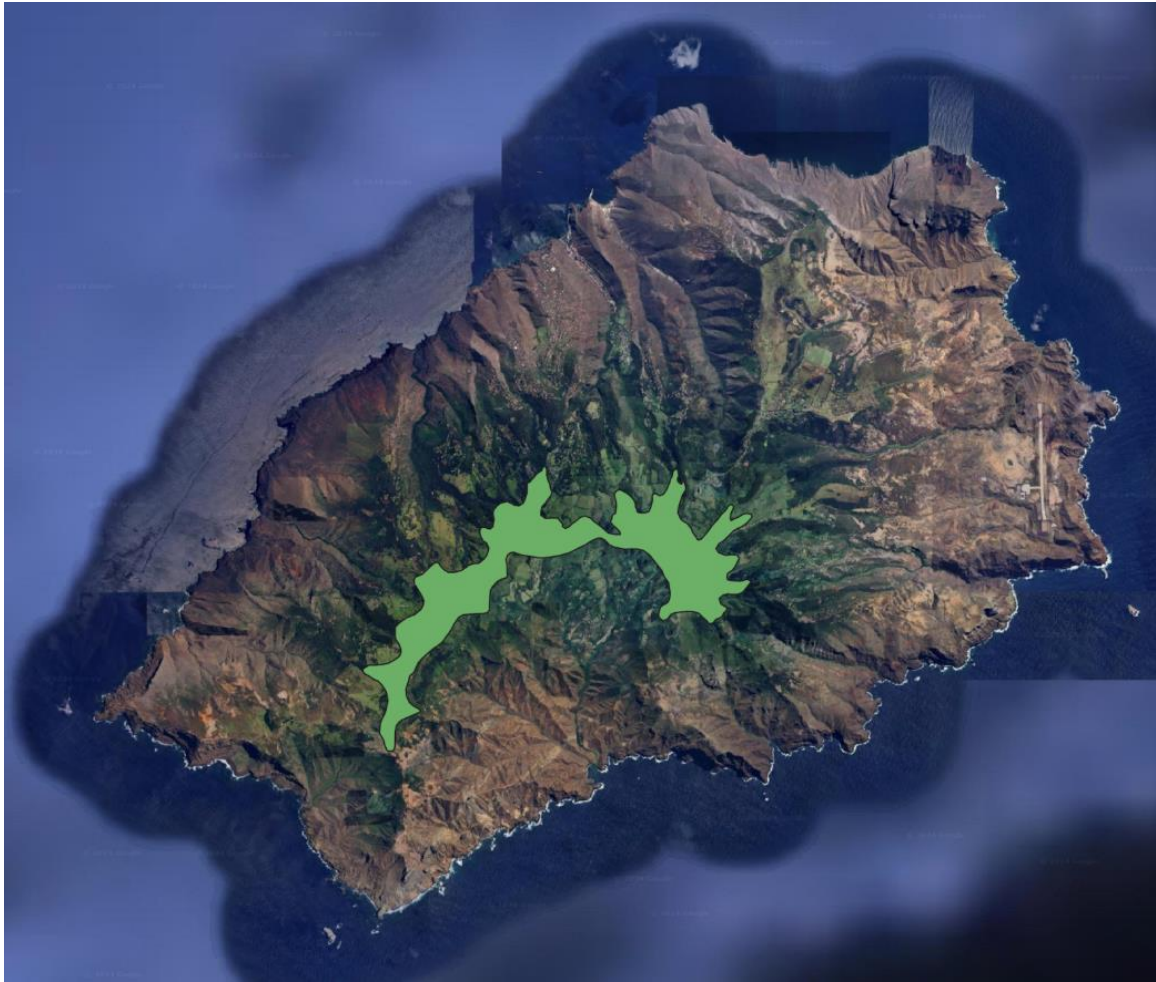
Figure S2. The indigenous range of the Spiky Yellow Woodlouse, which comprises 600 ha of cloud forest on the island of St Helena.