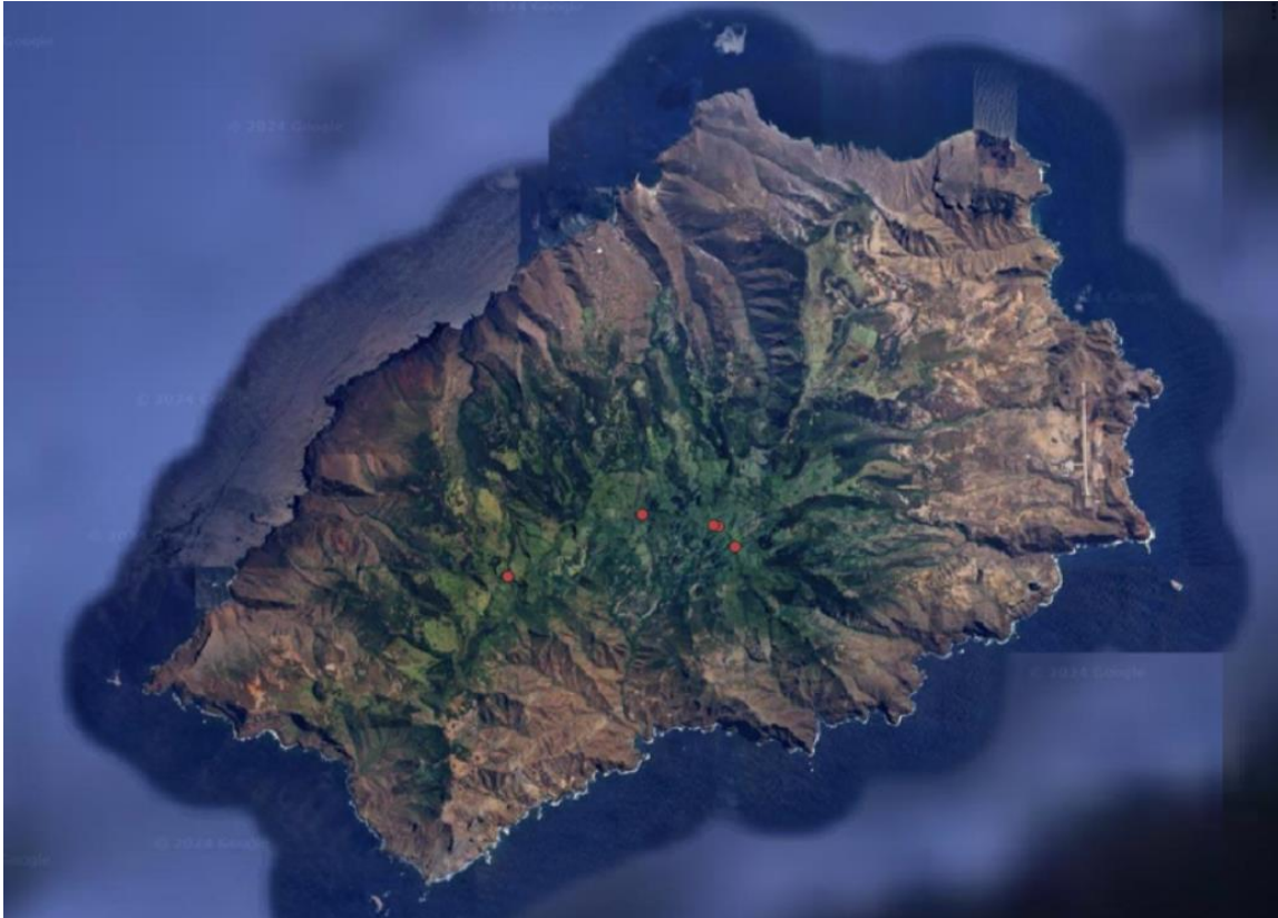
Figure S3. Current occurrence records of the Spike Yellow Woodlouse on St Helena.